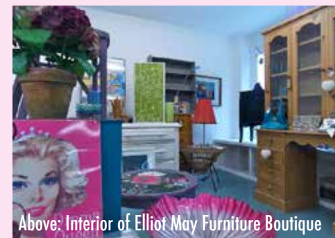
Above: Interior of Elliot May Furniture Boutique

If you fancy getting creative this summer, the first Elliot May furniture painting workshop is scheduled July 20th: 10am-3pm Includes all materials & a small piece of furniture to take home. Lunch & refreshments throughout the day. In this full day workshop you will learn about: Preparation and sanding, 3 different paint techniques, Cracking, Gilding, Effective use of waxes, & Decoupage.