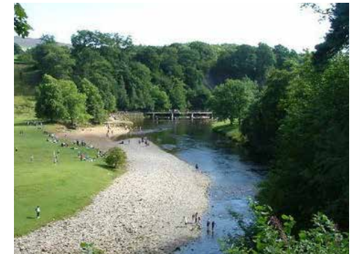
Bolton Abbey Estate

For children, the adventure that springs from playing in and around woods just cannot be measured. Climbing trees, exploring along paths, picking up pine cones, paddling at the water's edge and running across bridges, are all part of the fun of youth. Getting muddy is what being a "kid" is all about – and eating ice creams, of course! At Bolton Abbey, the brand new Welly Walk will allow children to do all that and more. The Welly Walk is an adventure trail for all the family, it will be taking place every day throughout the school summer holidays. Come rain or shine, children can bring their wellies and get stuck into the many activities along the way.